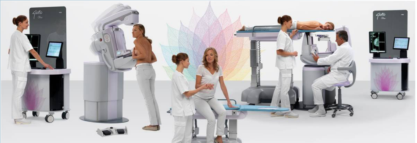
Modern mammography. The Giotto Class mammography/tomosynthesis unit with the optional accessories "FlexiTable" and "SmartFinder" for biopsy examination.

choosing the ECON100 was the two CANOpen ports which make it possible to configure communication at two different speeds — to adjust to different stub lengths within the network.